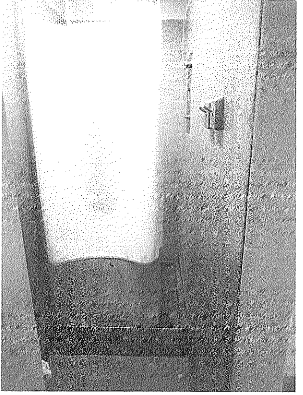
B: Level 2 Cellblock Shower