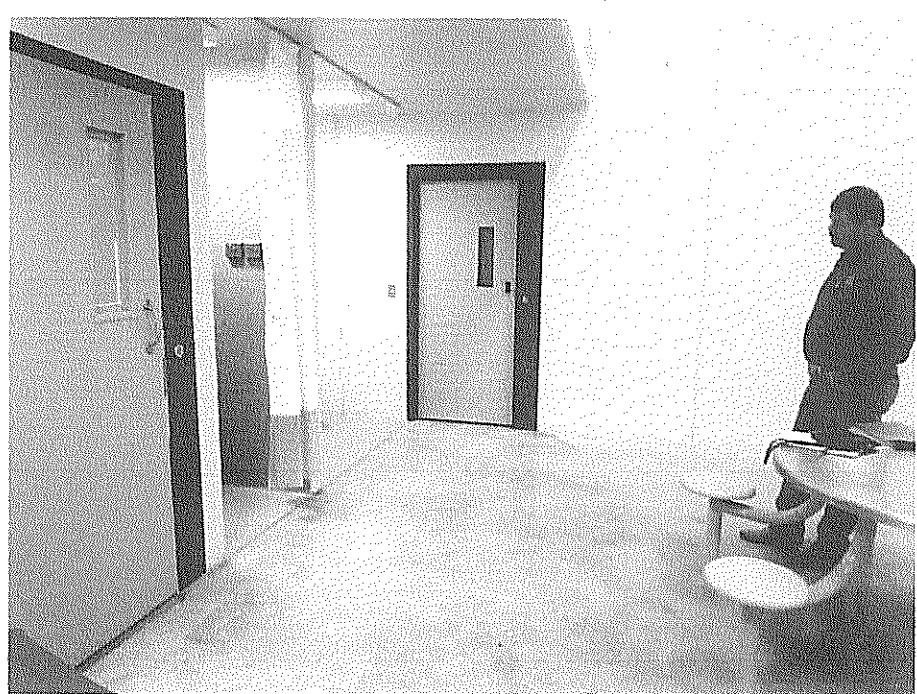
C: Level 1 Cellblock Shower