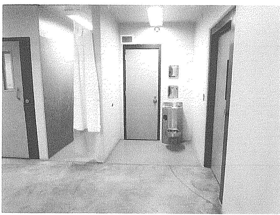
B: Level 1 Cellblock Shower